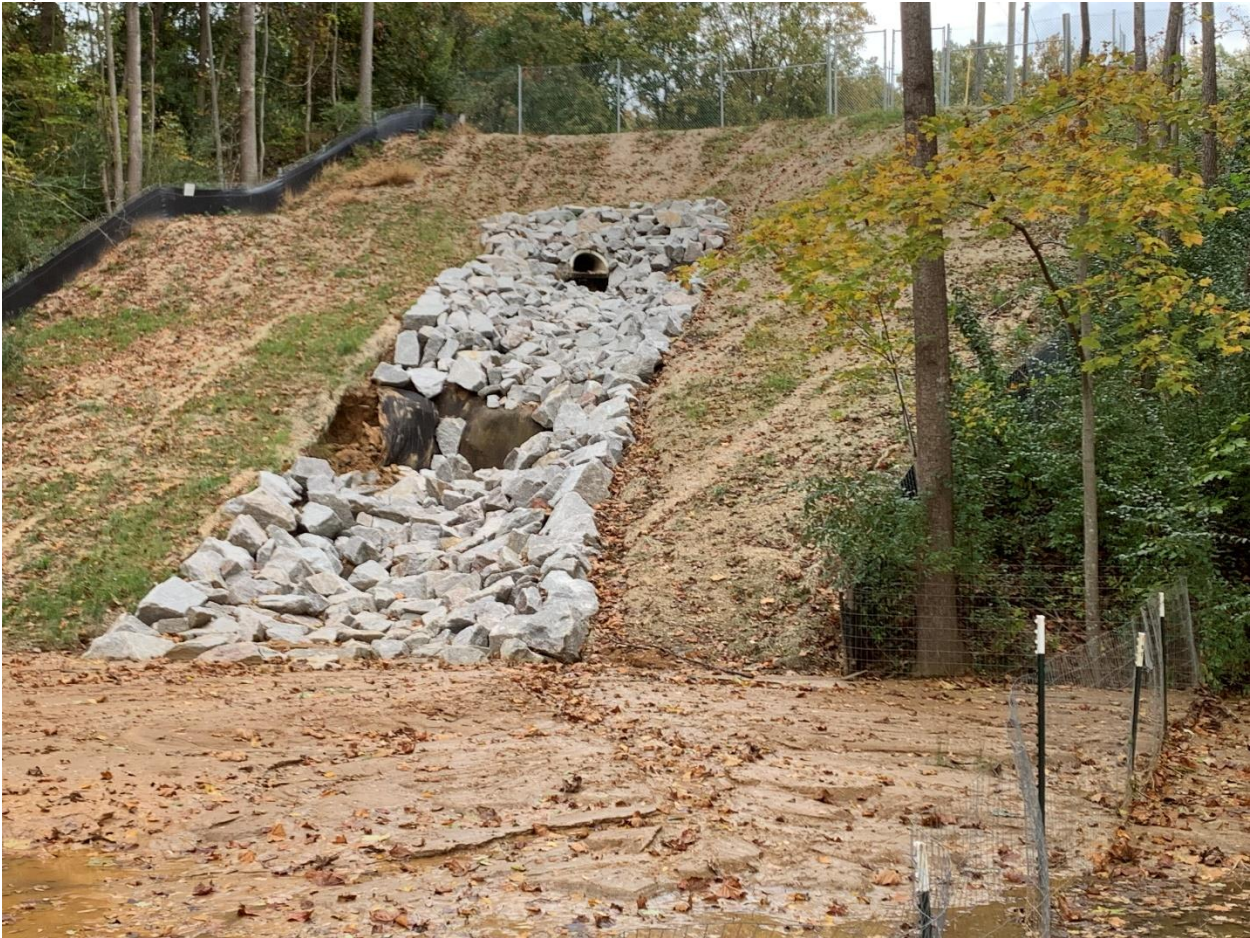
Discharging stormwater into an open channel on a steep slope seemed unwise from the beginning.