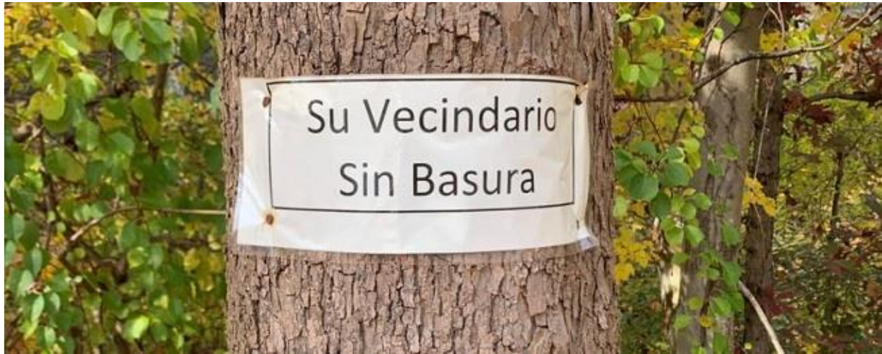
"Su vecindario Sin basura" - "Your neighborhood Without trash" These little pleas for community pride have appeared along Americana Drive.