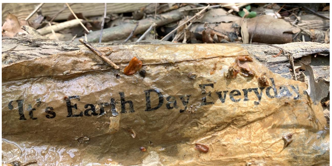
Ironic Rubbish – Happy Earth Day!

Philip shared this photo of a taunting bit of rubbish we found.