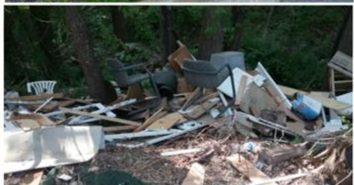
We congratulate you!