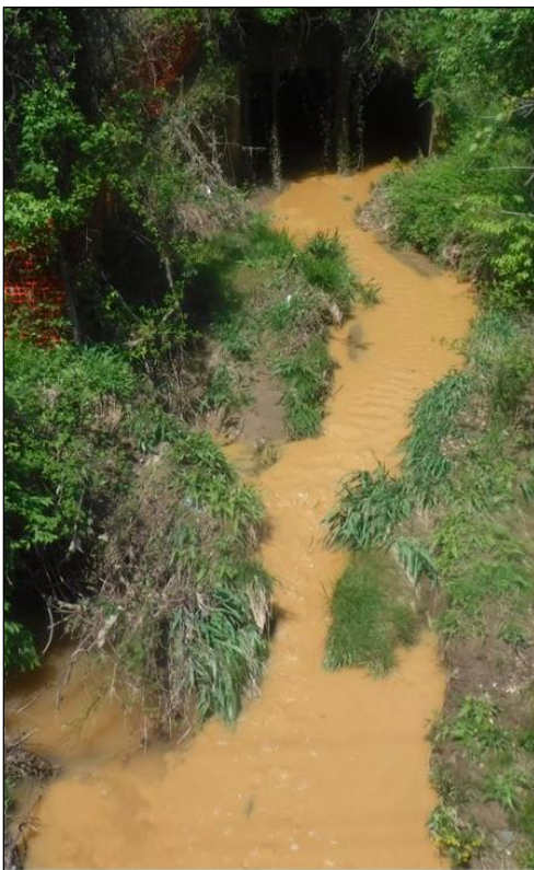
Mosby Woods tributary opaque with sediment

Plant Nova Natives & Fairfax County Restoration Project are collaborating on revegetation with natives, and improved stormwater controls. Someone has arranged for the topic to be discussed by the Board of Supervisors. Updates will follow.