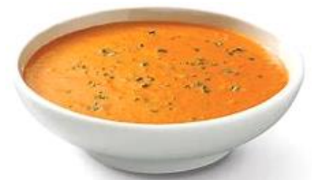
VDOT's Accotink bisque?

Many of us were copied on email exchanges regarding pollution events Kris and Philip witnessed on April 15 th , with the water of two different tributaries looking like tomato bisque. In Long Branch north they were able to see sediment being pumped and witnessed the silt bag as it collapsed. In the Mosby Woods tributary coming through the Chain Bridge Road tributary, the water looked even more opaque but the source was not visible. Philip stated the water was clear as gin in the same tributary before it entered the work zone.