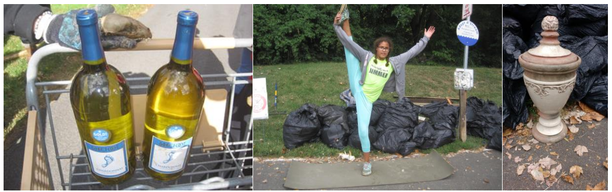
Strange cleanup finds - Chardonnay, yoga mat, cremation urn

Philip observed in prior years we never reached 200 fall volunteers, but we had 271 this time. We removed 243 bags of trash, 18 tires, and junk ranging from a cremation urn to bottles of Chardonnay.