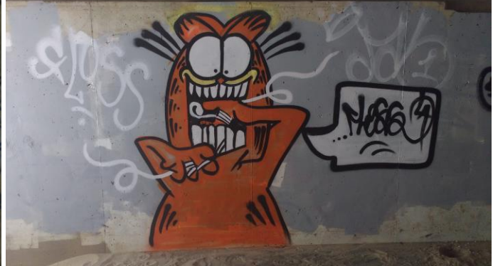
Impressive new grafitti art we encountered